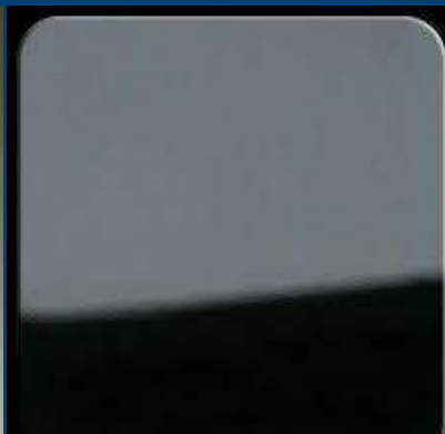
Black - Mirror finish