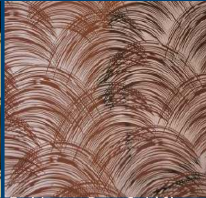
Etching on Rose Gold Sheet