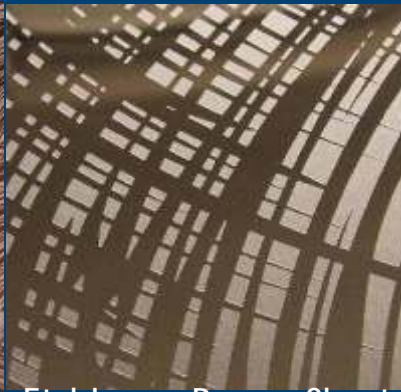
Etching on Bronze Sheet