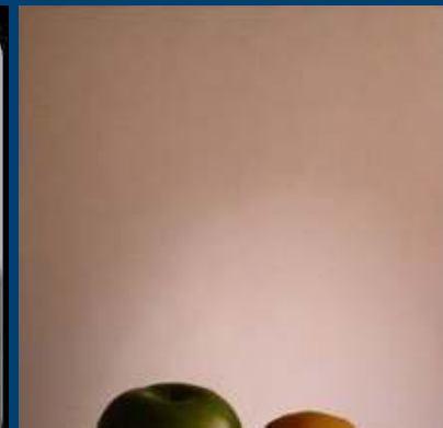
Rose Gold - Mirror finish