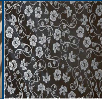
Etching on Black Sheet