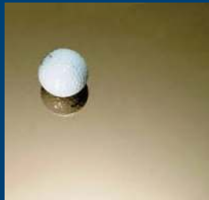
Gold Sheet - Mirror